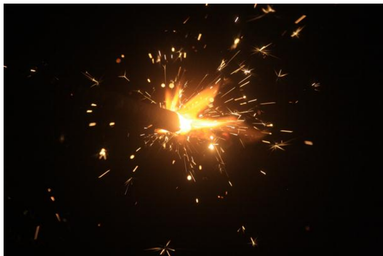
First prize :Arjith Angel (B Com Taxation)