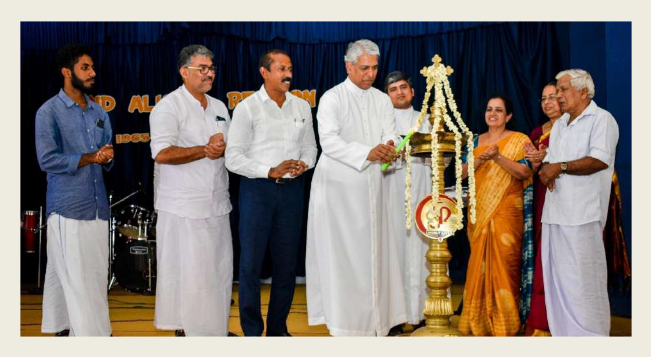
XIV Eminent Persons who visited the College during the year