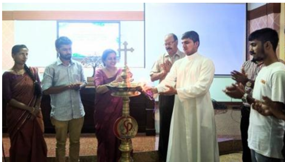
Principal inaugurating program