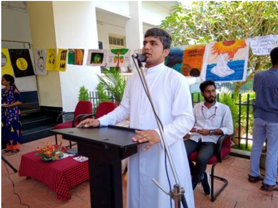
Principal and Assistant Manager delivering message to students